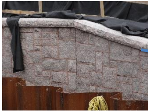
Riverway outlet. Closeup of wingwall faced with granite veneer, and "grapevine" masonry pointing.

Status as of Oct. 1, 2015 Completion scheduled for spring, 2016.