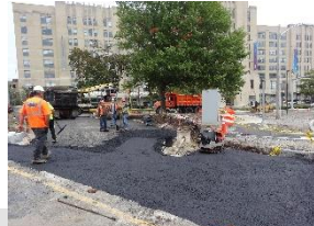
Riverway connector to Park Drive being constructed.