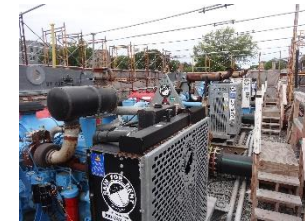
Pumps used to divert river around Upper Fens Pond. Pumps have a capacity of 44,000 gallons/minute.