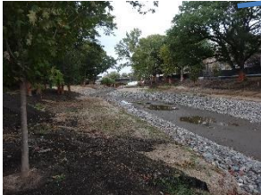
Upper Fens Pond – many trees have been protected during construction