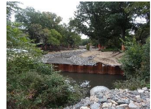
Upper Fens Pond from upstream culvert at "jughandle" road near Brookline Ave.