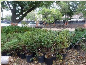
Upper Fens Pond shrubs waiting to be planted. Over 8,000 plants are specified for Phase 1. Here, over 200 fragrant sumac which attract birds and butterflies are awaiting planting this fall.