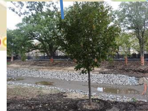
Upper Fens Pond - one of 15 sugar maples and over 200 trees specified for planting in Phase 1 area.