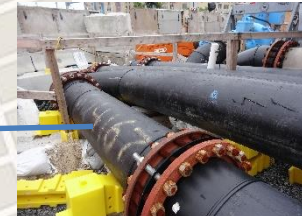
4 pipes are used to divert river water 2/10 mile from Brookline Ave. to Ave. Louis Pasteur during construction.